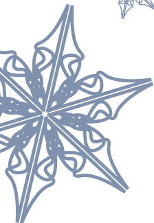
The Sussex Christmas